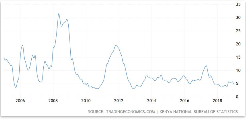
The annual rate of inflation in Kenya from 2005 until 2019. The Central Bank of Kenya has an inflation target rate of 2.5% to 7.5% which would translate into a doubling of prices every 15 years on average.

One scary behaviour that some pupils develop to survive in this crisis is that they get involved in relationships with old folks so that they can be financially helped.