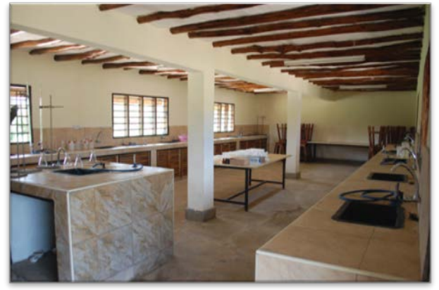
One of the two new Lulu Girls High School laboratories

It's two terms since I joined Mekaela Academies and there is development everywhere. A new laboratory, a new administration block and a library with a difference. That has happened in Lulu Girls and I know other clans are moving in the same rate. Within six