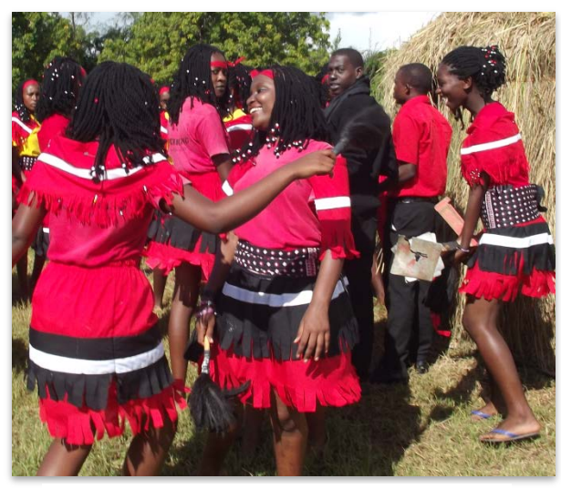
Culture can be fun!