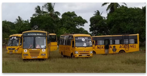
The "new" yellow Mekaela Academies fleet