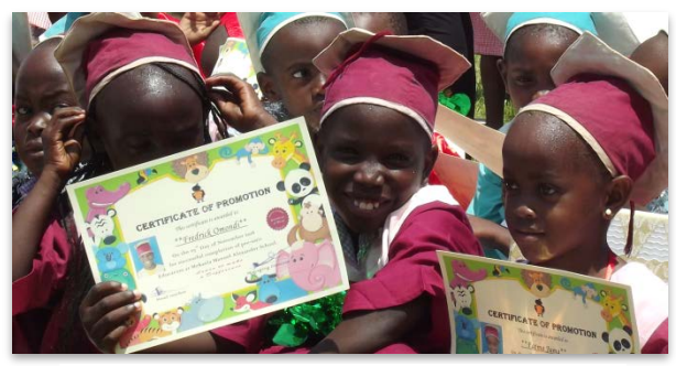
Look, Mummy, I made it!