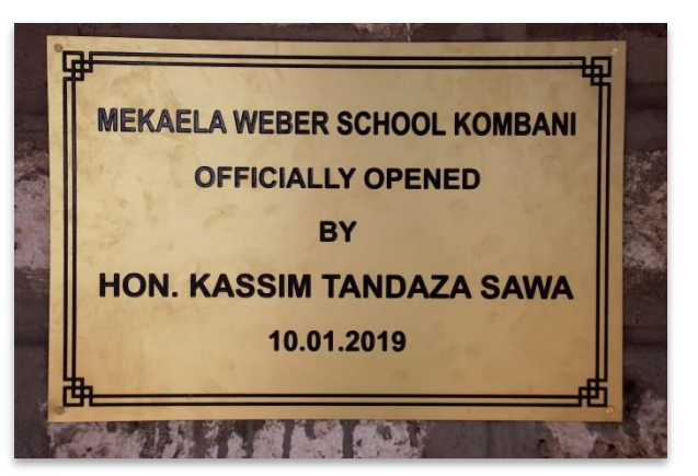
There is a little hint