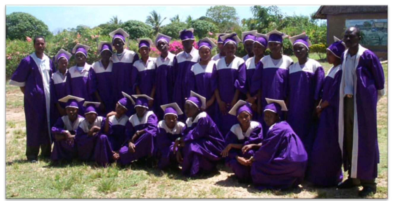
Manuel Alexander School Graduates Class of 2001