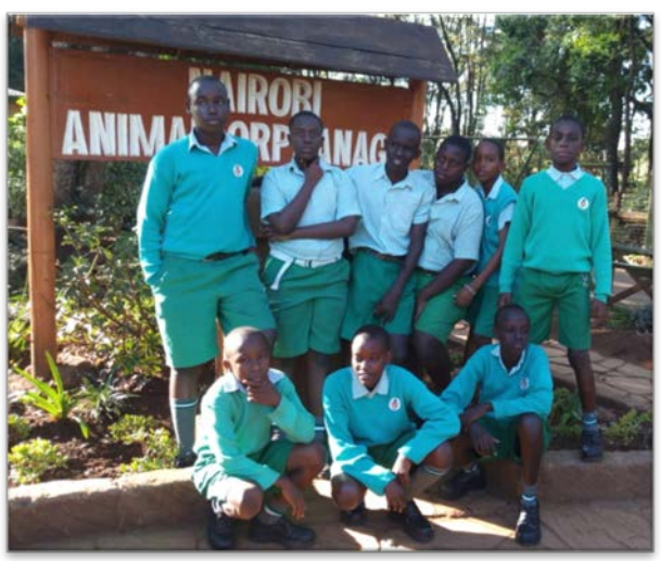
LPS Students on a trip to Nairobi

In the event where they meet other schools, they make new friends. In addition, barriers between pupils and teachers are broken so that they are able to interact freely, but of course with limits.