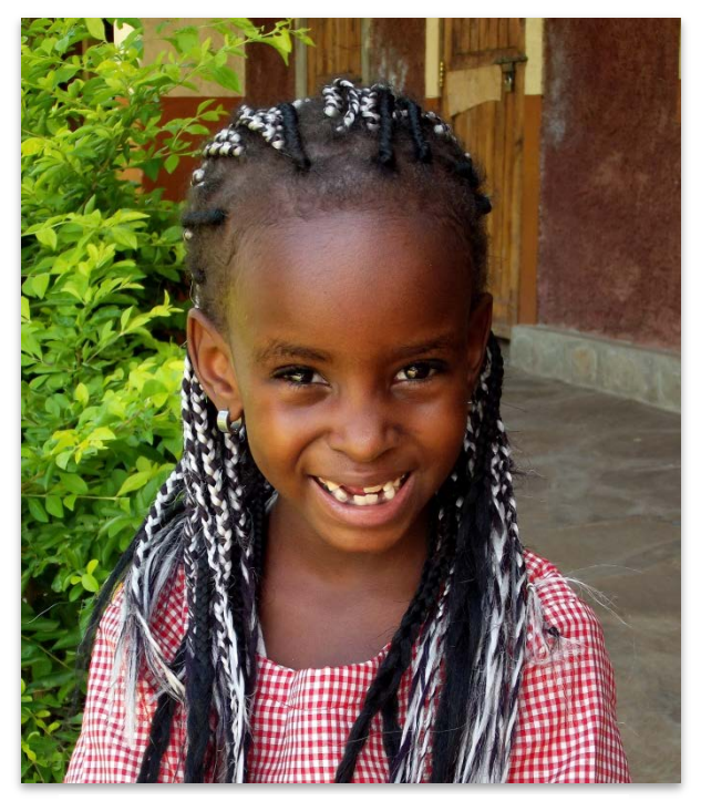
Say it with a smile