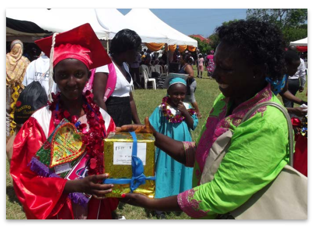
There is one proud mum