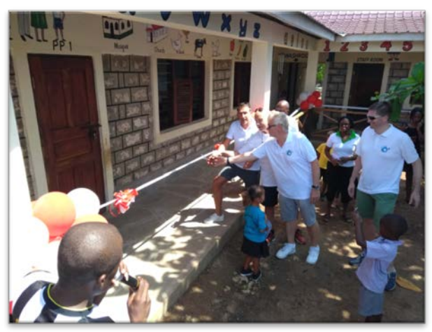
Official opening of the new MAS pre-school Unit by the donors from Fly & Help in October 2018

This year, we opened yet another ultra-modern preschool unit at Manuel Alexander School, tailor made to meet the required standards of the new curriculum.