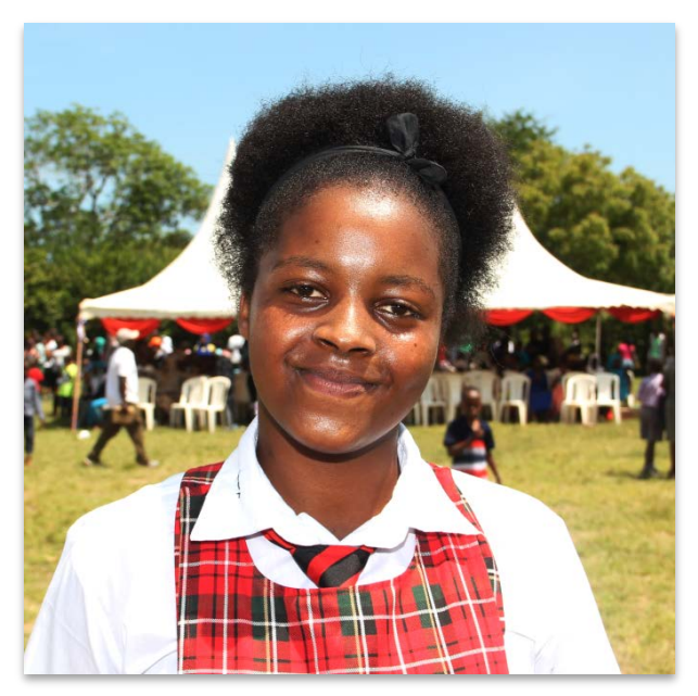
changed to "Kazi kwa wananchi, pesa kwa serikali." We don't need a driver to drive the truth home, do we? Of course we don't.

Kenyans are complaining now and then because of high taxation which is now a talk of the town. Consequently, standards of living in the citizens are deteriorating. Does the government feed on money or are the leaders' pockets torn? The infrastructure is still poor - roads have potholes leading to accidents now and then - thousands of graduates are still at home jobless, slums are developing in every corner of the country, there is teacher shortage in all the public schools, our public hospitals are understaffed and inadequately equipped.