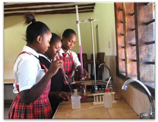
Lulu Girls High School students conducting experiments

Allow me to call this a community made up of five clans: Lulu Boys High School, Lulu Girls High School, Manuel Alexander School, Likunda School and Ratinga School all within a common ancestry; the Mekaela family.