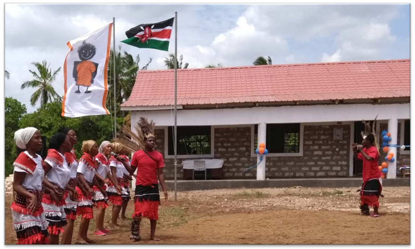
Artists performing at the official opening of Mekaela Weber School in January, 2019