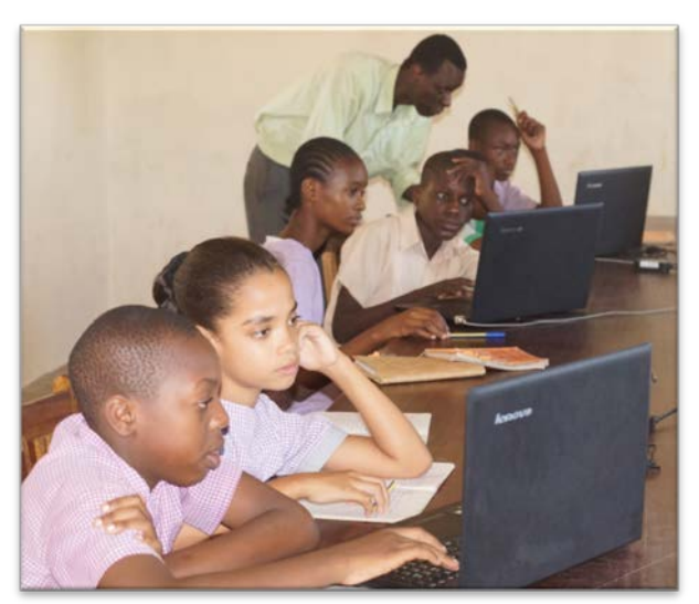
MAS students during computer class

Computer studies is one subject that I have come to like while here in Mekaela Academies. To some people, computer studies might just be a study but to us it is important.