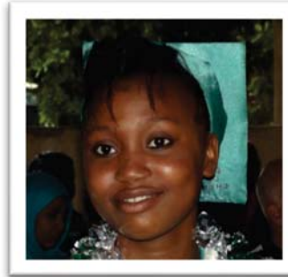
Making parents happy: LPS Graduand

do what they believe can help in helping their learners achieve excellence.