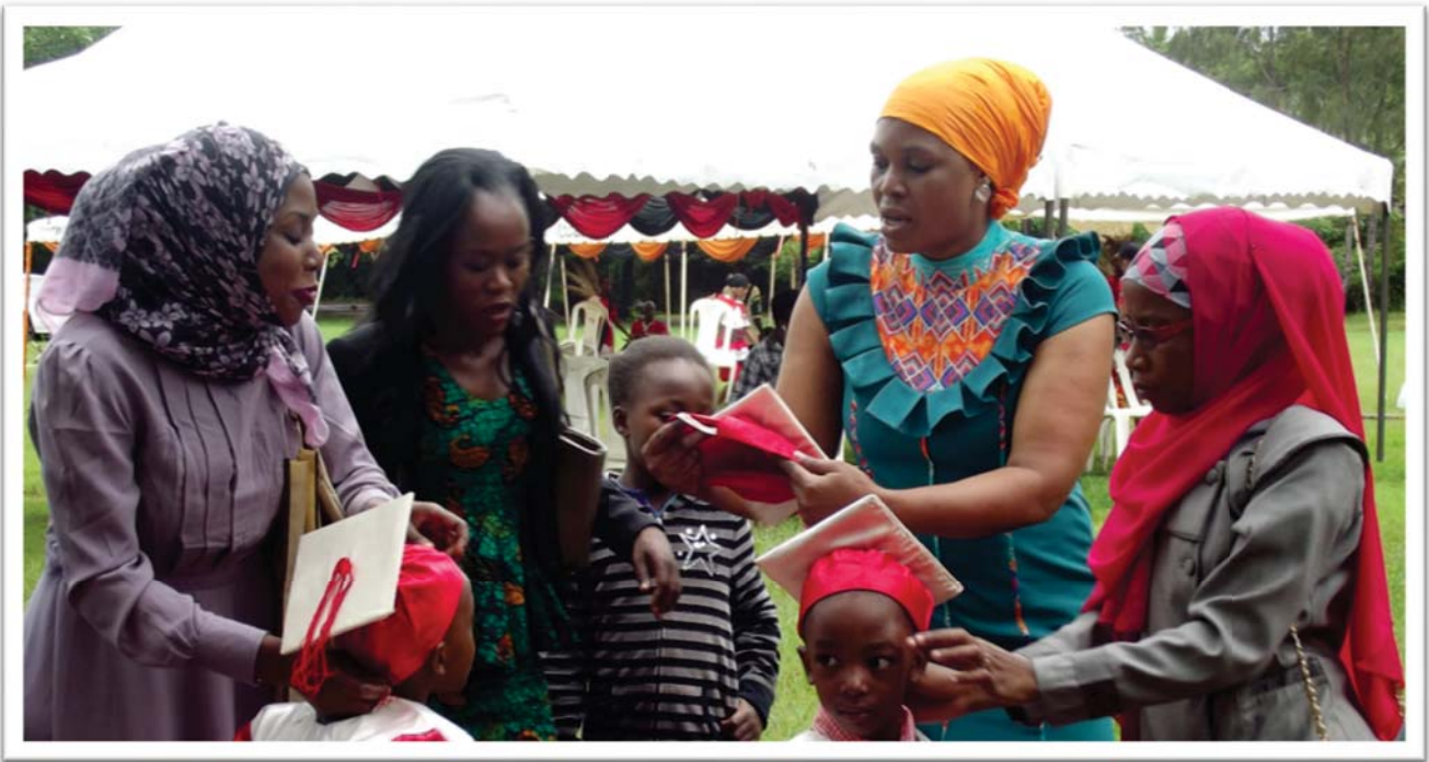
Proud and smart: mothers and Ratinga graduants at the 2017 Graduation Day